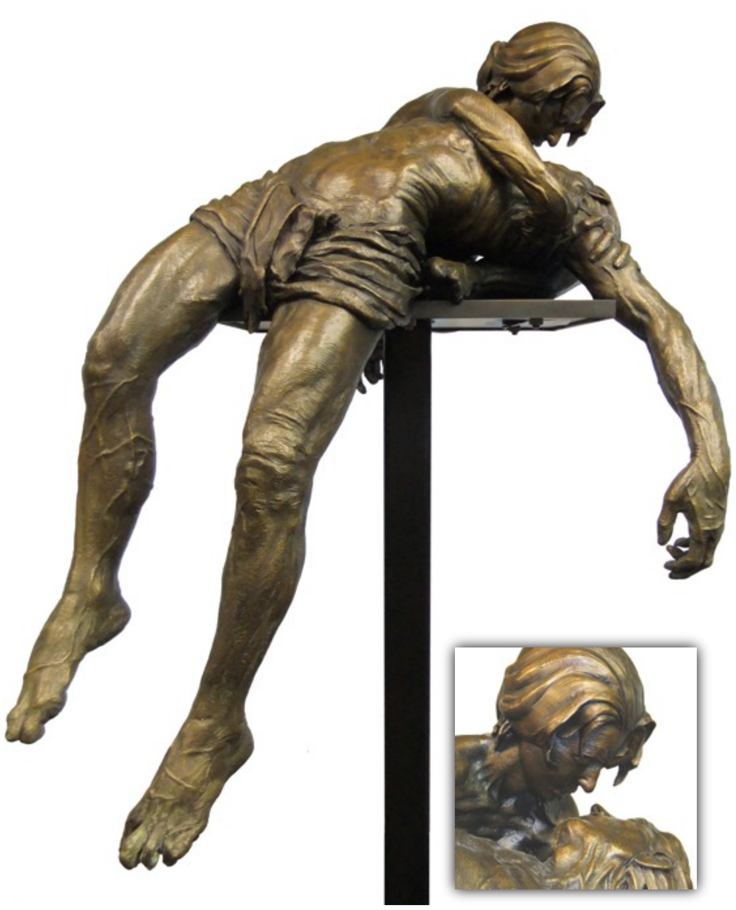
Cindy Jackson Falling Away 2011 bronze 72" tall x 48" wide x 36" deep